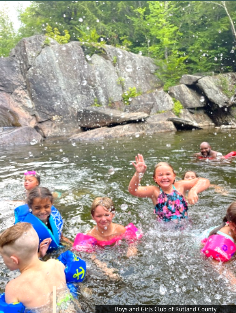
Boys and Girls Club of Rutland County

Vermont Parks Forever worked with Boys and Girls Clubs in both Rutland County and Greater Vergennes. The Boys and Girls Club of Rutland County hosted summer camps for 100 children. Participants hiked, swam, fished, kayaked, and learned outdoor survival skills in several parks. The Boys and Girls Club of Greater Vergennes enjoyed the beauty of Vermont's first state park during a hiking excursion to the top of Mt. Philo and enjoyed a swimming trip at Button Bay State Park. Both clubs stated that passes from Vermont Parks Forever inspired future outdoor programming.