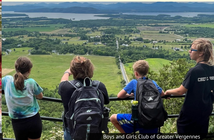
Boys and Girls Club of Greater Vergennes

- Boys and Girls Club of Rutland County Participants