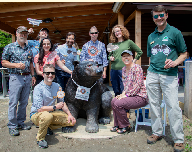
VPF Board and Staff at the Groton Nature Center